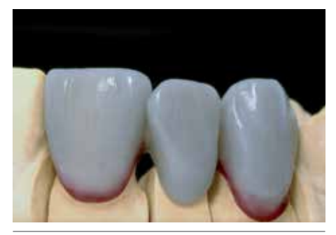
Sculpting wax FC, grey REF 40105