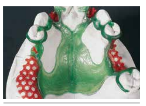
Medium stippled casting wax placed centrally in the deep palate