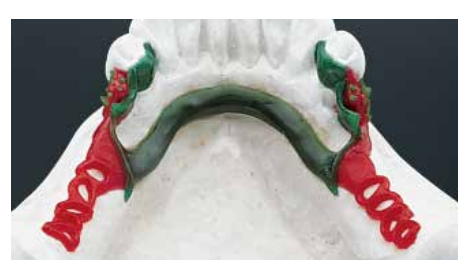
Wax hole retention