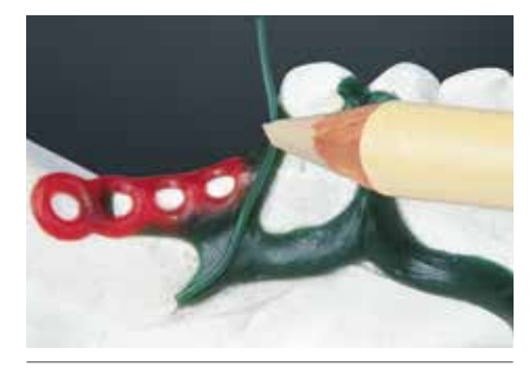
Beading wire 0.8 mm