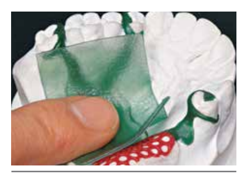
Crease-free adaptation of the fine stippled casting wax

Before making the model, the investment material can be sprayed with Durofluid to improve adhesion of wax profiles still further. The modelling wax can be adapted more easily if, in addition, the model is preheated to 35 °C.