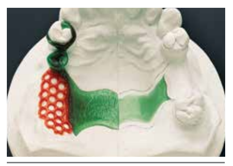
Coarse casting wax over smooth casting wax ensures defined plate thickness