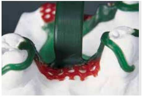
Casting strip 2.0 x 6.5 mm