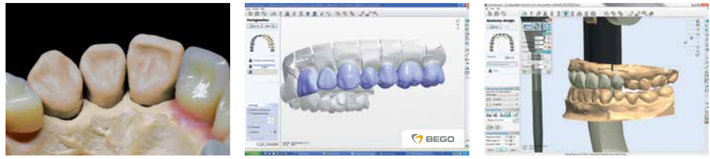
Wax scan in the virtual articulator