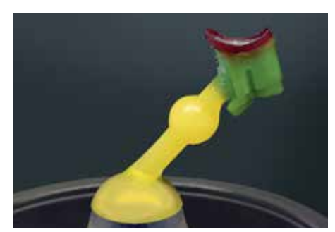
Wax ball – funnel seal