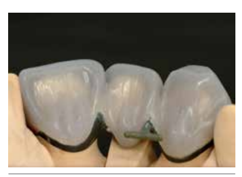
Fully anatomical wax-up