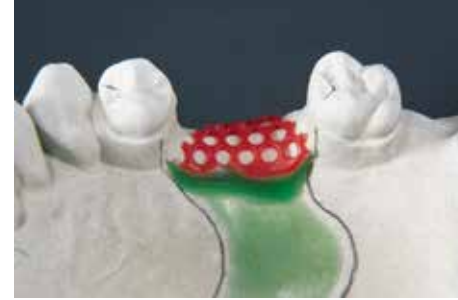
Wax clasp step