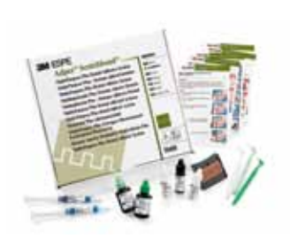
3M<sup>™</sup> ESPE<sup>™</sup> Adper<sup>™</sup> Scotchbond<sup>™</sup> Multi-Purpose Plus Adhesive System Intro Kit