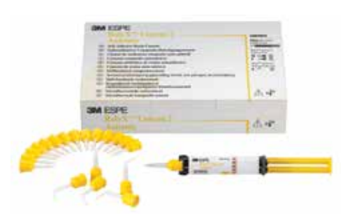
RelyX<sup>™</sup> Unicem 2 Automix Cement Refill – A2 (56846)