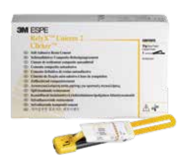
RelyX<sup>™</sup> Unicem 2 Clicker<sup>™</sup> Dispenser Refill – A2 (56875)